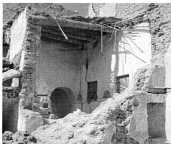
Neglected Heritage in the Middle East: The Abandoned Quarter of Ghadames