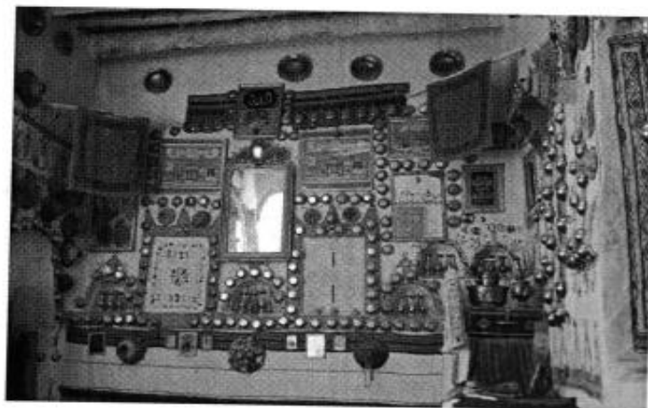
House Interiors, Main Hall: Decorative Elements, Ghadames