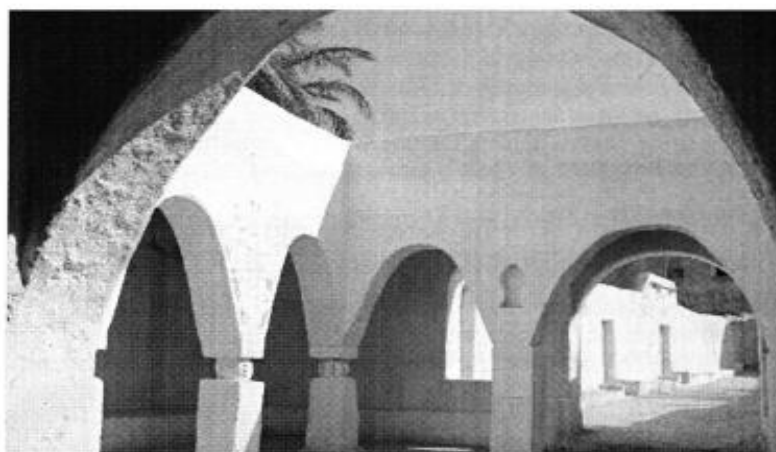
Town Squares in Ghadames