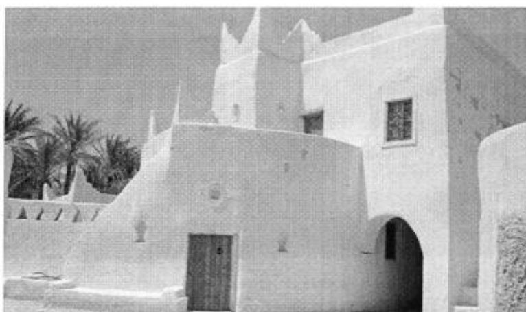
Traditional School in Ghadames