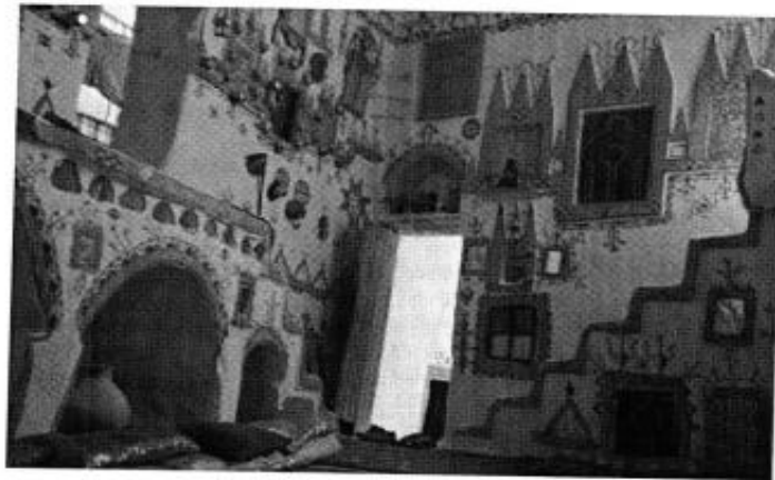
House interiors of the main hall with its beautiful paintings in Ghadames