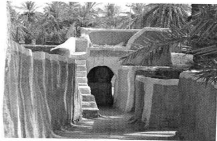
The Organic City of Ghadames. One of the Main Access to Gardens